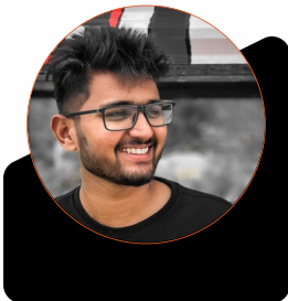
Tharun Naika Youtuber