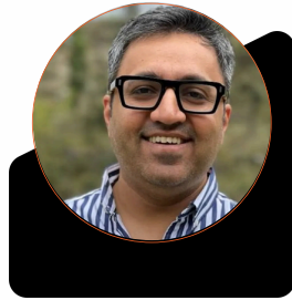
Ashneer Grover Founder - BharatPe