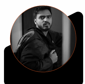
Amit Bhadana Indian Comedian & Writer