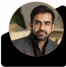
Nikhil Kamath Founder - Zerodha