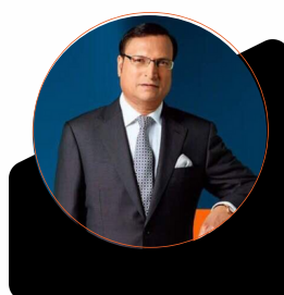
Rajat Sharma Chairman - India TV