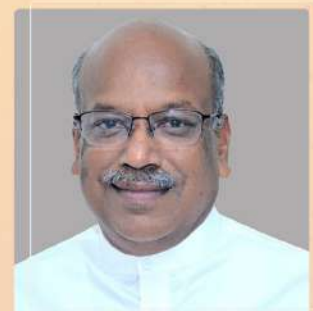
Shri Sanjay Shamrao Dhotre Hon'ble Minister of State for Education