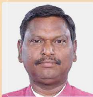
Shri Arjun Munda Hon'ble Minister of Tribal Affairs