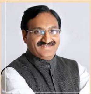
Shri Ramesh Pokhriyal 'Nishank' Hon'ble Education Minister