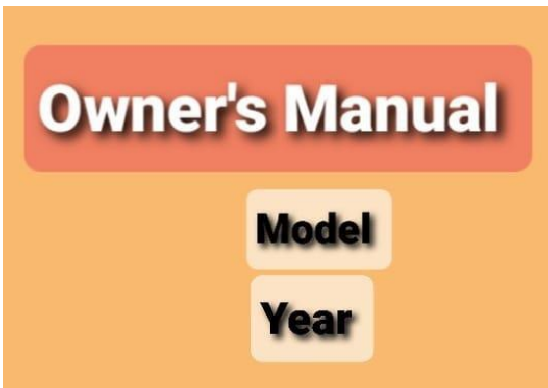
Fig 6.2 Owner's Manual

The Owner's manual is an important document and should always be kept in the vehicle. If they sell the vehicle, always pass on the documents to the new owner.