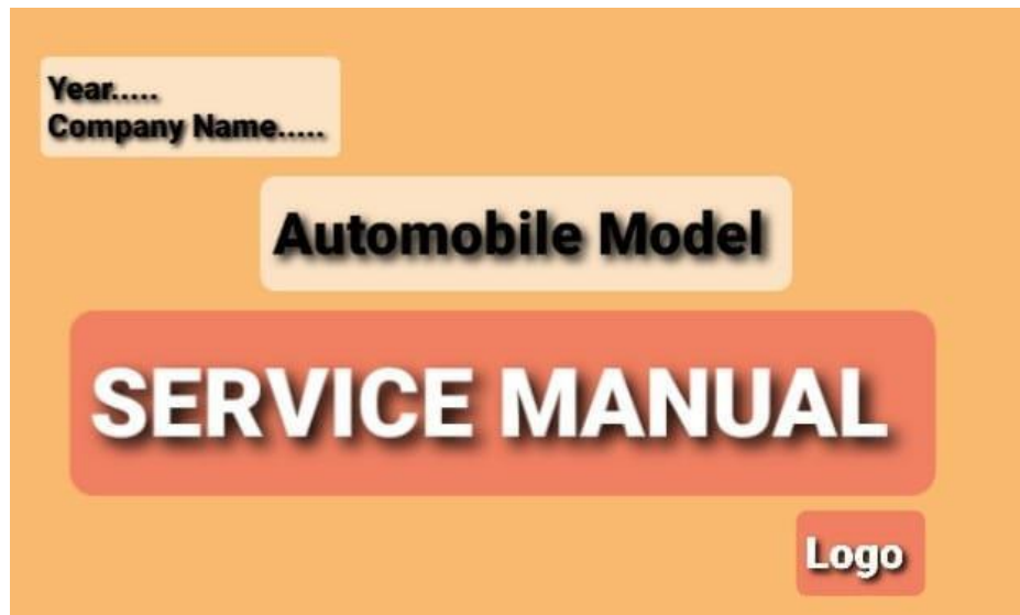
Fig 6.1 Service Manual