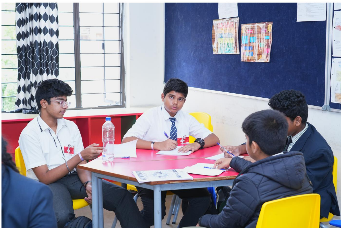
PATHSHALA NUKKAD KI: On Contemporary Themes